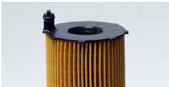
Figure 1: Well thought-out to the last detail: the patented pin for the MAHLE oil filter insert with O-ring seal.

A black plastic mandrel with an O-ring seal is mounted at the end plate of the filter element—known throughout the industry as the MAHLE pin. In the assembled state, the pin fits precisely into the bore in the filter housing and seals it off.