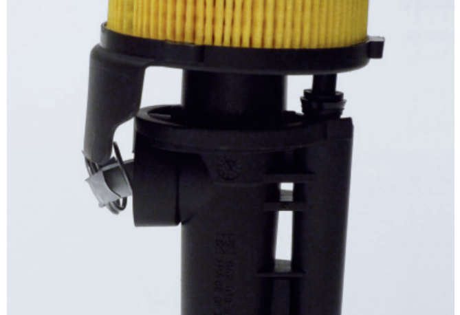
Figure 4: Detailed view of the damaged by-pass valve.