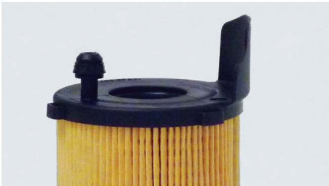
Figure 3: Replica with blade: while it may not damage MAHLE's patent, it can potentially damage the by-pass valve on the engine.

Another problem: the sharp plastic blade can come dangerously close to the by-pass valve in the housing, damage it, and put it out of action. This means: the by-pass valve, which should only be opened for short periods in certain situations, is now permanently open—and lets the unfiltered oil circulate (unnoticed!) continuously through the engine. The inevitable consequence is serious engine damage!